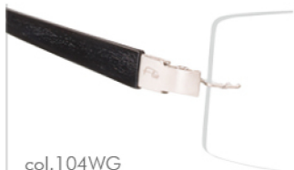
col.104WG incl. FLAIR accessory